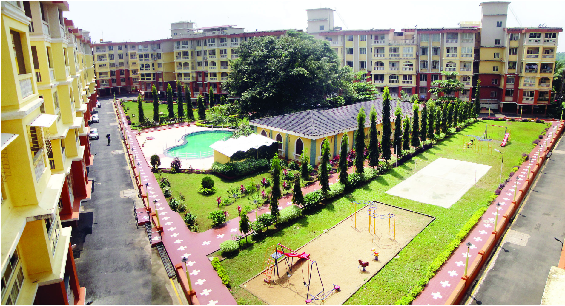
Devashri Garden, Porvorim ▲