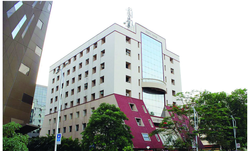
Dempo Tower ▲