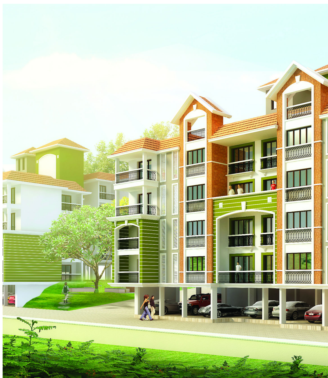
Devashri Greens, Porvorim ▼

Without revealing turnover, suffice it to say that their order book is 600-strong, which means they are on the way to breaking the 2,000-housing unit ceiling soon.