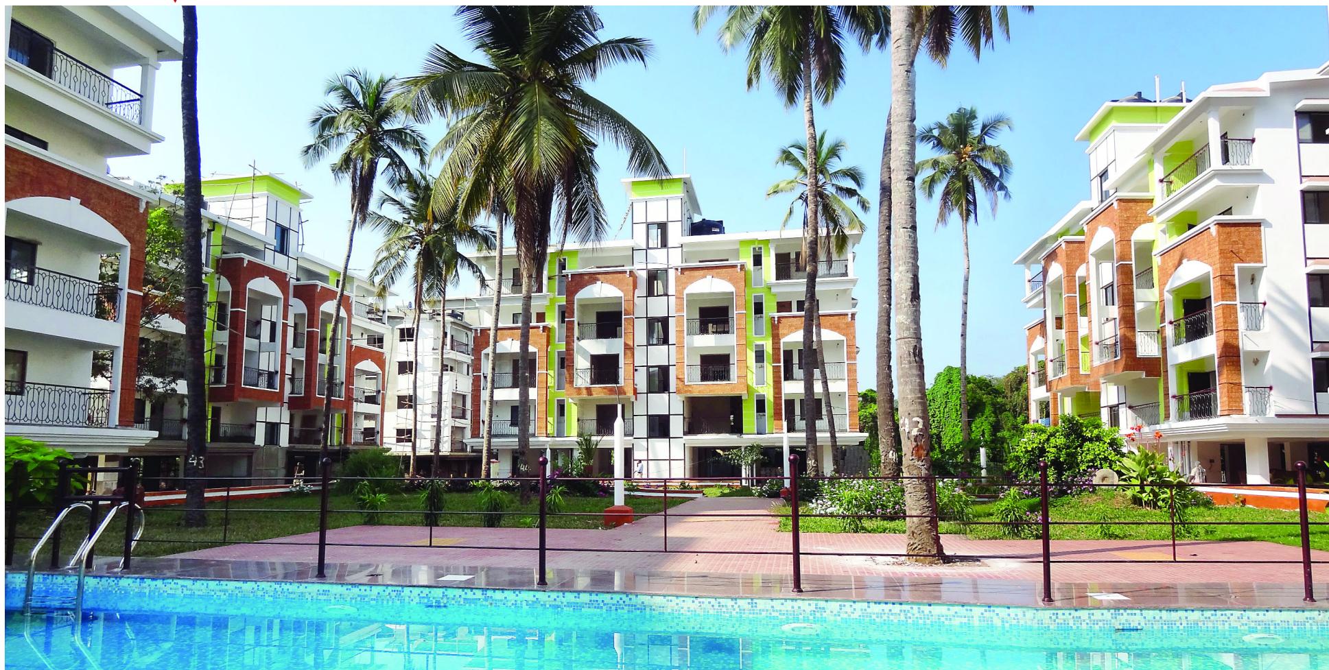
▼ Monarch Palms