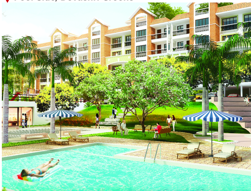
▼ Pool Side, Devashri Greens

“Without going into numbers, my gut feeling tells me that Devashri has outperformed the real estate sector,” he adds