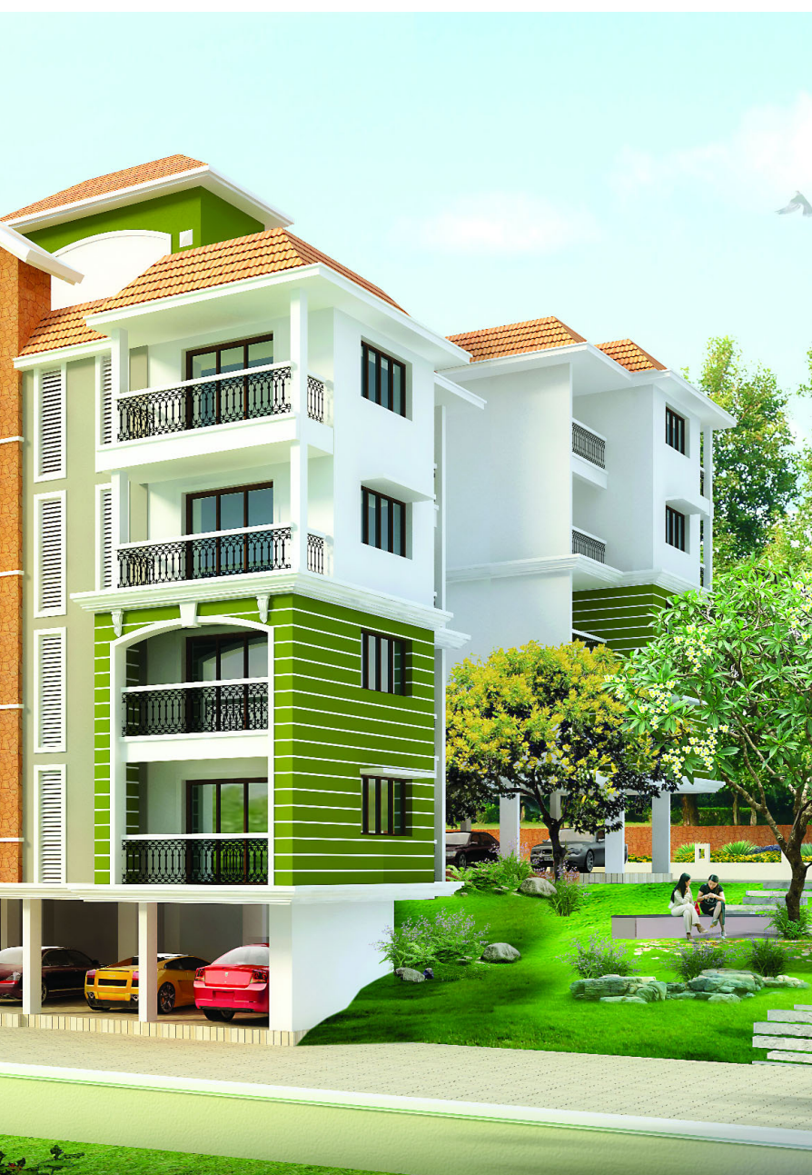
Devashri Greens, Porvorim ▲