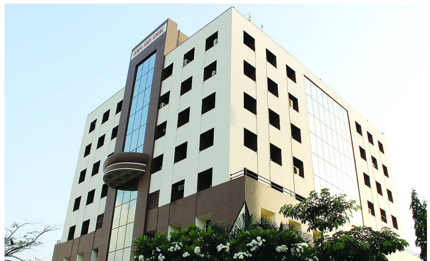
Dempo Trade Centre ▲